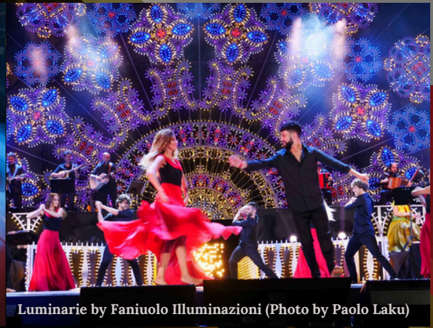
Luminarie by Faniuolo Illuminazioni